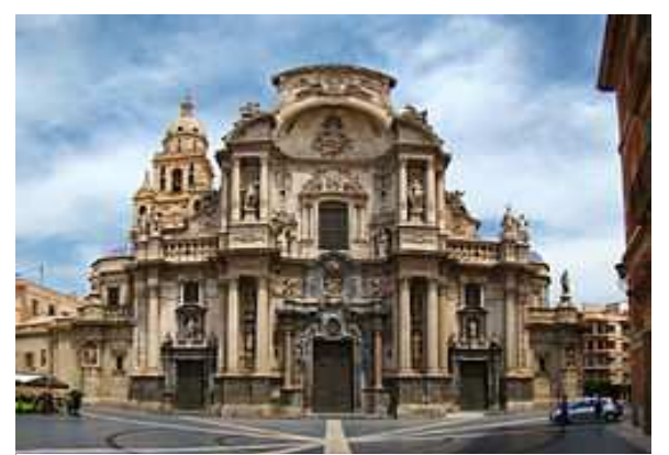
Cathedral in Murcia