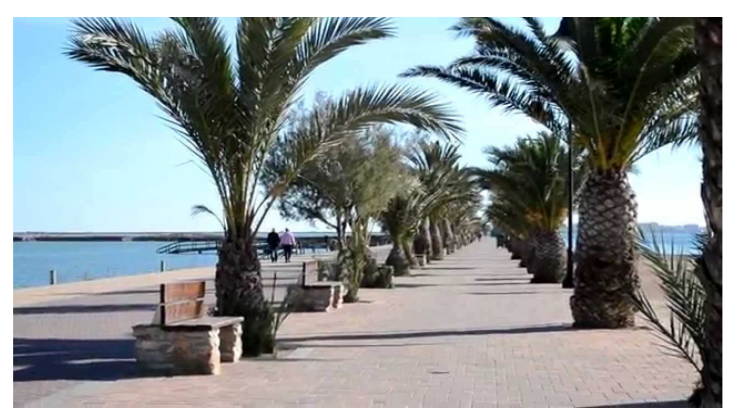
La Manga Promenade