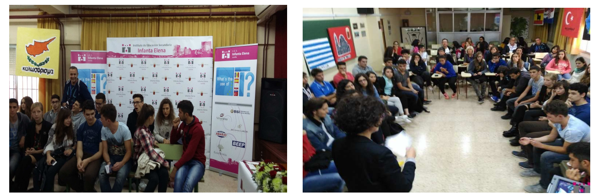
The debate on Math based on the video: Making Math cool

The official working part consisted of visiting classrooms, attending classes and workshops in Mathematics, English, Greek, French, Economics, the Music Art and video editing), as well as PowerPoint presentations and a very dynamic discussion at the debate (the Round Table ) about the importance and the method of teaching mathematics, which was organized in high school Infanta Elena, the secondary school in Jumilla. Both students and the teachers contributed to the discussion with their own attitudes and experience. On the other hand, the teachers themselves fully agreed upon all the work responsibilities and tasks for further work.