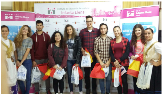
Croatian students with the host members

The official working part consisted of visiting classrooms, attending classes and workshops in Mathematics, English, Greek, French, Economics, the Music Art and video editing), as well as PowerPoint presentations and a very dynamic discussion at the debate (the Round Table ) about the importance and the method of teaching mathematics, which was organized in high school Infanta Elena, the secondary school in Jumilla. Both students and the teachers contributed to the discussion with their own attitudes and experience. On the other hand, the teachers themselves fully agreed upon all the work responsibilities and tasks for further work.