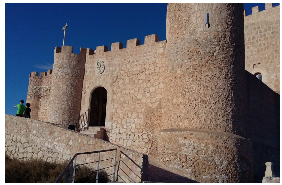
Castle of Jumilla