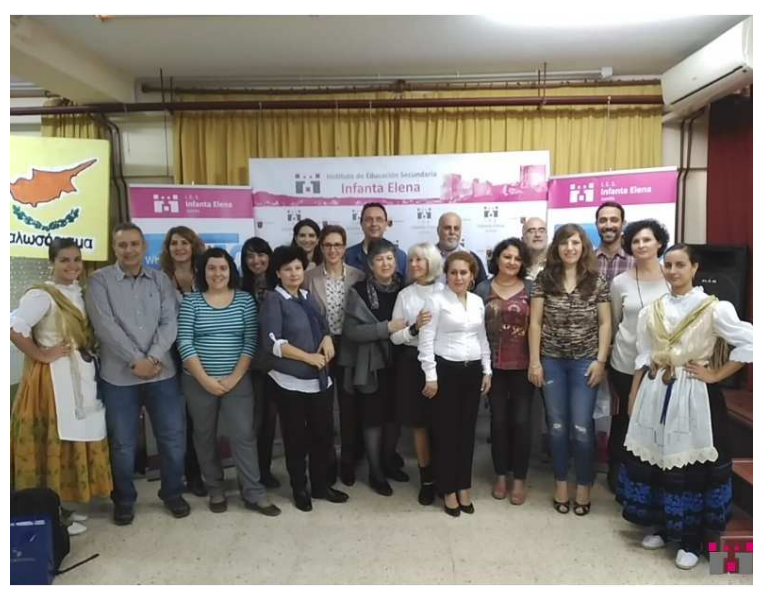
European teachers in the Project

The extracurricular part included either a half-day or a day trip to Murcia, La Manga, Cartagena and the famous fortress Castillo de Jumilla. Particularly significant was the reception in the Town Hall with the mayor of the host city and visit the old Vico Theatre , as well as numerous Christian churches and cathedrals.