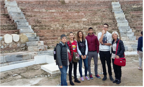
Roman Theatre, Cartagena