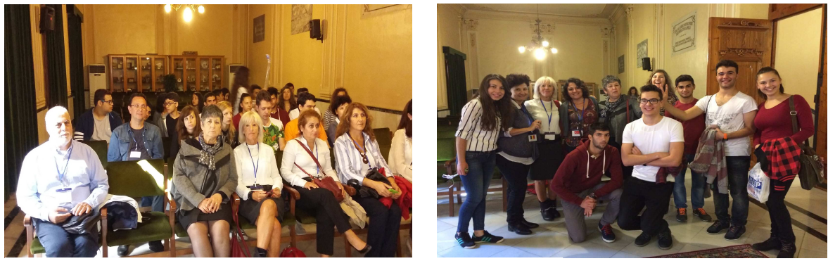
Reception at the Mayor's office