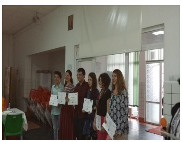
Turkish team from Ankara