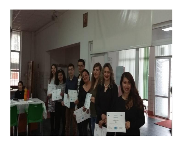
Turkish team from Denizli