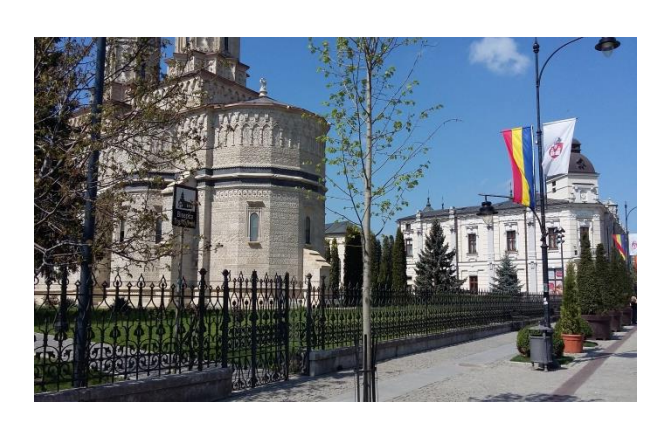
lasi: Monastery of the Three Hierarchs