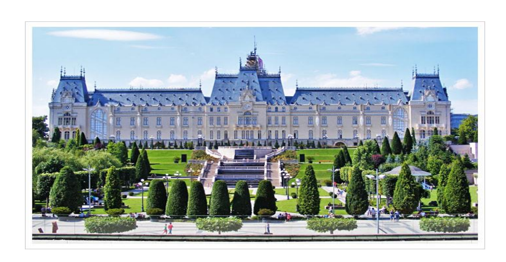
Iasi: Palace of Culture