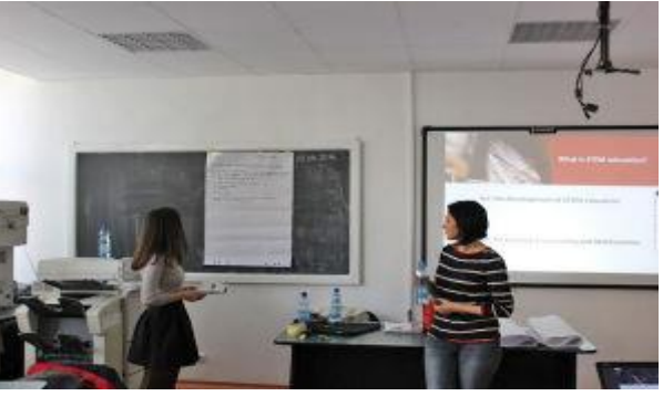
Presentation on STEM issue