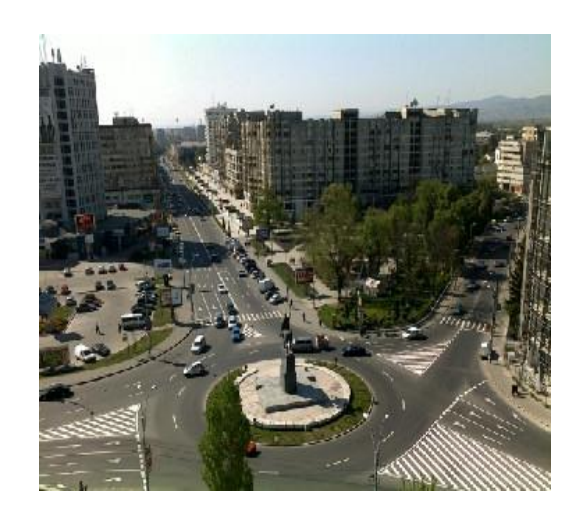
Centre of Bacau