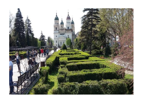
Iasi: Metropolitan Cathedral