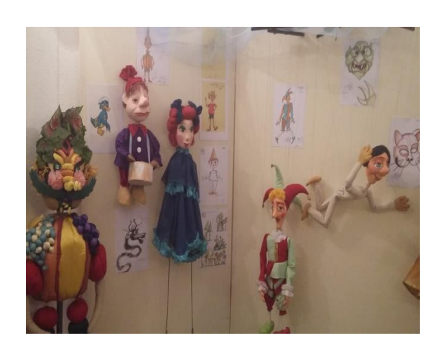
Bacau theatre: puppets