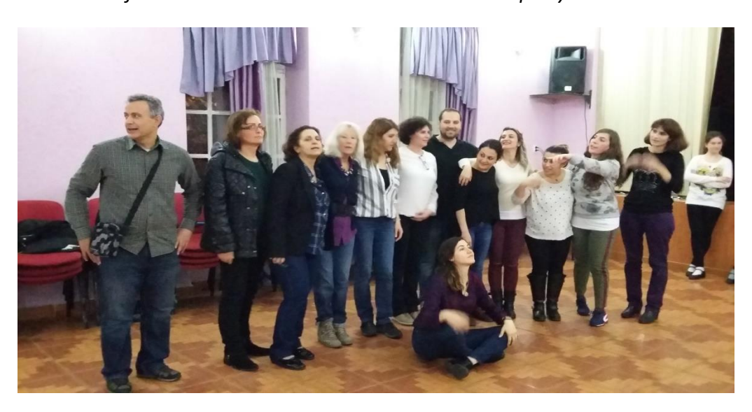
Dance: teachers' memorable extra-curricular activity