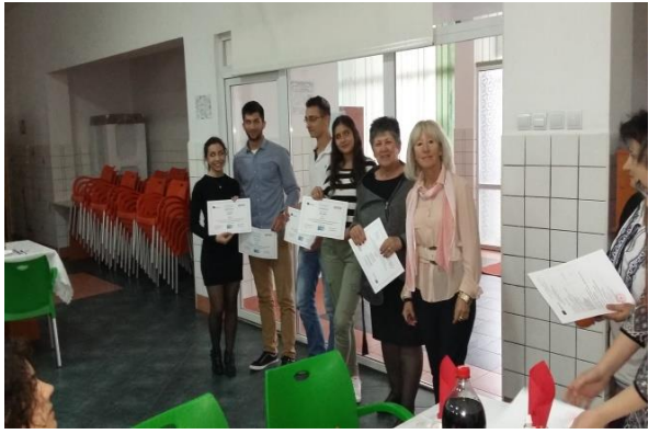
Croats with the host members