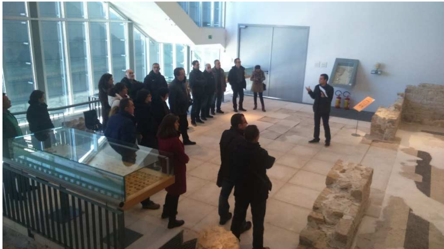
Archeological Narona Museum

In addition to the working sessions, the guests had the opportunity to get to know the town, visit the ancient Archeological Narona Museum, take a ride in the typical boats on the Neretva. They were also taken to the nearby towns of Ston and Dubrovnik, the Pearl of the Adriatic.