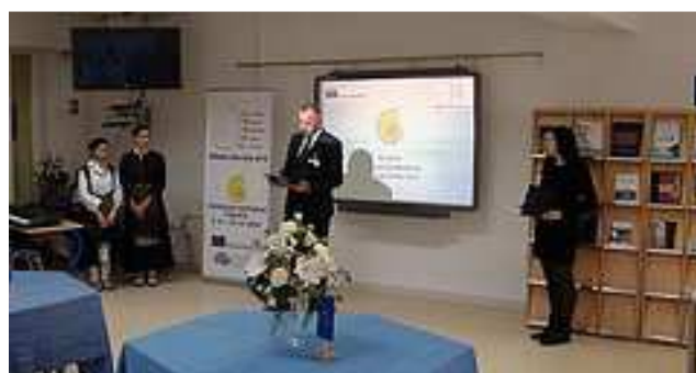
The school principal