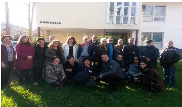
All participants in front of the school