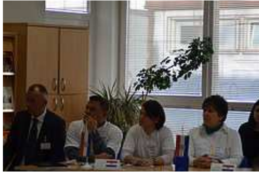
The Croatian team

Each team was supposed to make a presentation on their school, town, country with the idea of breaking ice and getting to know each other better.