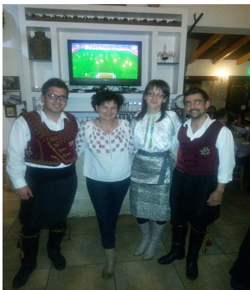
Cypriot folk dancers and Romanian folk costumes

Owing to the kindest and most hospitable friends, the Cypriot partners - the Croats, Romanians and Spaniards had a memorable opportunity to get to know the country's cultural heritage, which is the most important treasure of its people. Everybody is fully aware that Cyprus, as the easternmost part of Europe, constitutes a cultural bridge between people of different religions, cultures and ways of life.