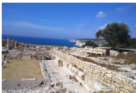
Magnificent archeological site, Kourion (Curium)