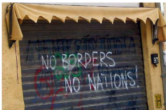
Graffiti, graffiti .....

The next stop was Nicosia (Lefkosia), the capital town with the Walled Old Town Center or a walk up to the barrier «The Green Line» that has been dividing Nicosia into two, since the Turkish invasion in 1974.