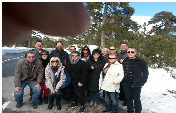
Troods mountains (1951 m) in the heart of Cyprus

There were impressive contrasts between the top of the Troods mountains covered with snow and a several kilometers long beach promenade with the temperature of 23° C.