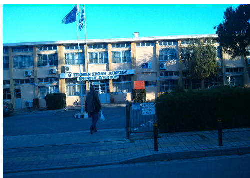
B' Techniki Scholi Lemesou "Gregoris Afxentiou"