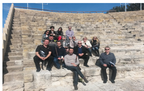
Greco-Roman theatre in Kourion (2. c. BC)