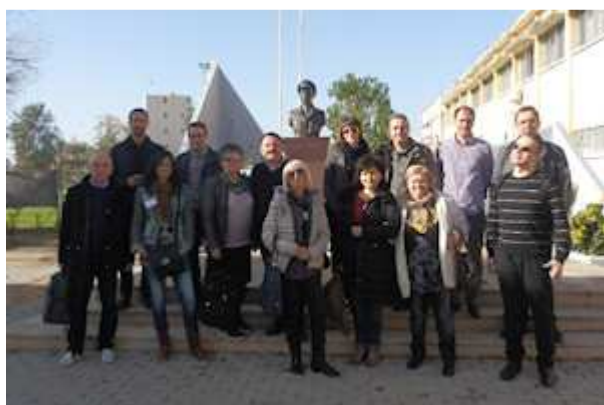
International project members