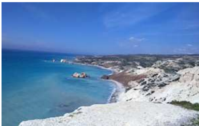
The Rock of Aphrodite

On the way to Pafos (Paphos) there is the Rock of Aphrodite (Petra tou Romiou), the very spot where the Goddess of love and beauty was carried by white sea foam from Kythera in Greece.