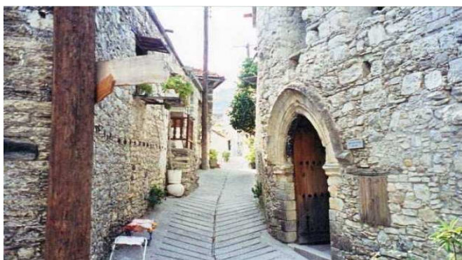
Omodos , with narrow cobbled streets.

Limassol (Lemesos), the second largest city is the island's main port and the centre of Cyprus wine industry. The city is also known for its lively Carnival celebrations. 39 km of Lemesos is the wine producing village of Omodos .