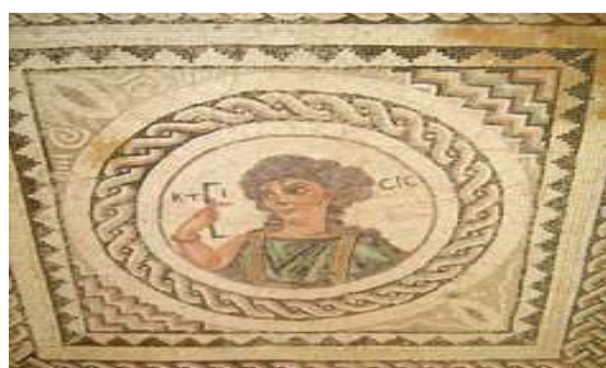
Breathtaking mosaics, (scenes from Greek Mythology)